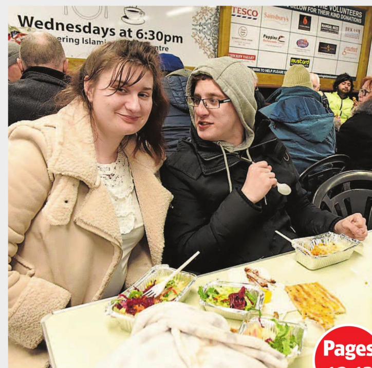
Visitors enjoying food and hot drinks at the soup kitchen in the grounds of the Havering Islamic Cultural Centre in Romford