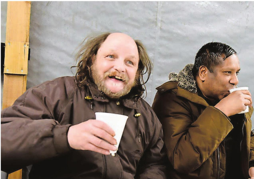
Smiles all round for visitors at Havering Islamic Cultural Centre