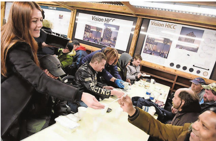
Volunteers handing out food.

ago his new employee was sleeping in a bike shed.