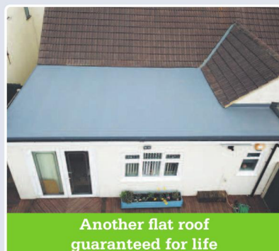
Another flat roof guaranteed for life

High-Tech Roofing has now installed and guaranteed more than 10,000 domestic projects – every roof we install comes complete with a LIFETIME guarantee. We give the homeowner absolute peace of mind.